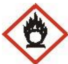
GHS03 – Oxidizer solid, class 3