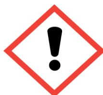
GHS07 – Eye irritation, class 2